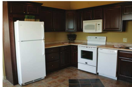
The living and kitchen areas in the upstairs lofts