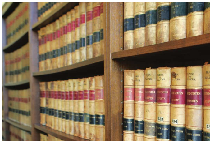
The building houses Arkansas Reports going back to the 1870s

The building has truly become an asset once again. ♦