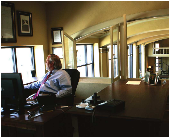
H.T. looks out from his office on the mezzanine onto the city street below