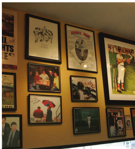
Part of H.T.'s baseball collection