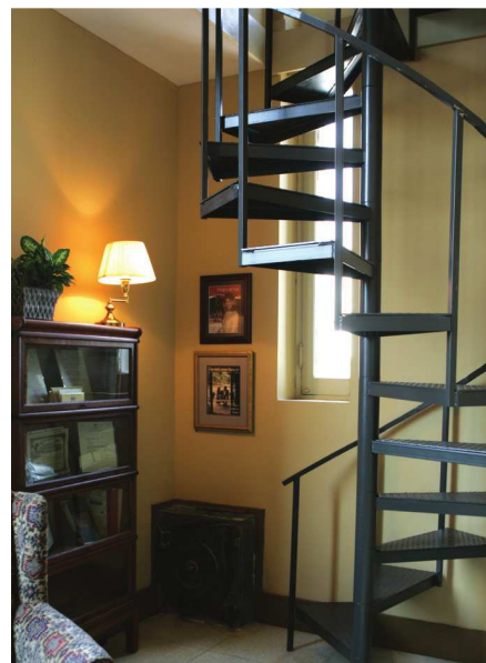
The winding staircase to Linda Lou's office upstairs where guards used to sit with a shotgun