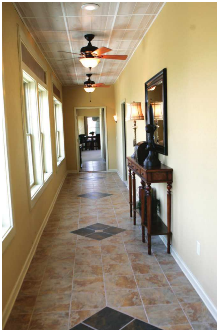
The hallway upstairs in the loft apartments